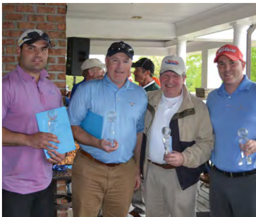
Golfers show their winning trophies.