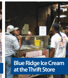
Blue Ridge Ice Cream at the Thrift Store