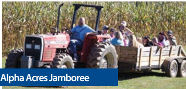
Alpha Acres Jamboree