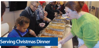
Serving Christmas Dinner