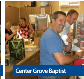
Center Grove Baptist